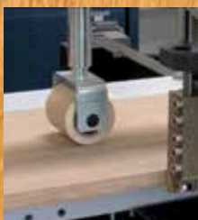
Edge Filling and Edge Sealing